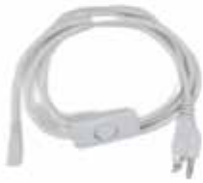
6ft On/Off Cable