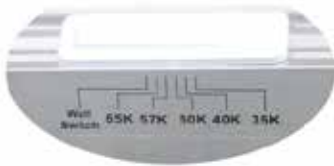
Slide Switch for CCT Selection