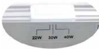
Slide Switch for Wattage Selection